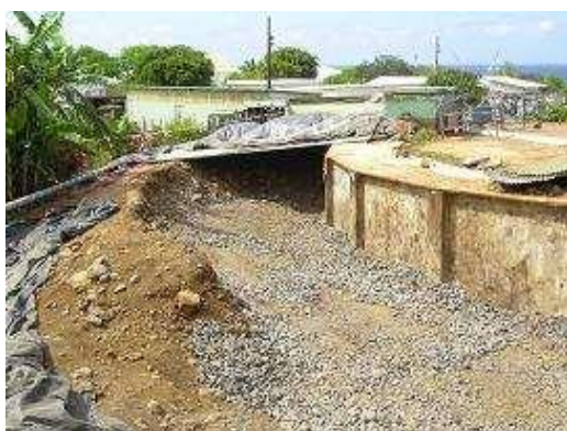
▲ Backfill around tank SEA2 ©