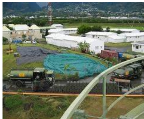
▲ Product infiltration zones ©

Following emergency operations that involved stopping the spillage, containing the fuel, shutting down the drinking water supply well, waste collection and the superficial clean-up of the zone, the initial digging operations were undertaken to remove the highly polluted soil as soon as possible. This required the tank's casing to be uncovered and the tank drained. The soiled earth was stored in bins on the site B prior to cleanup, and an initial review was conducted to determine the environmental impact of the accident. Research projects to install and equip a facility to treat the soil were undertaken.