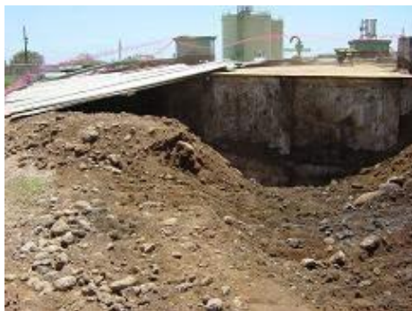
▲ Digging operations round the SEA2 tank

Awaiting validation of these studies, operations at the drinking water station were suspended and the polluted soil, still in place, was covered with tarps to protect it from the cyclonic rains of the island.