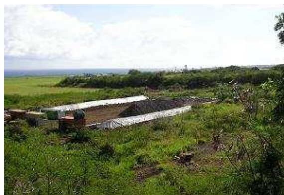
▲ Treatment of polluted soil

At the same time, the town of Sainte-Marie expressed its difficulty in procuring water following the closure of the well located at the depot B site. Analyses conducted by the operator of the depot A, and validated by the health authorities, show that the well water is not polluted. However, the drinking water supply well has not been placed back into service since the accident.